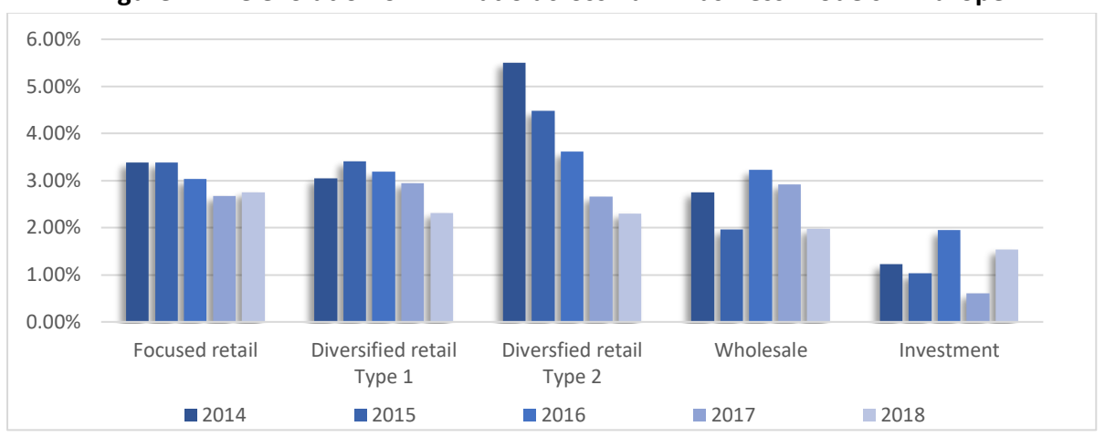
Figure 4. The evolution of NPL ratio across Bank Business Models in Europe

Note: Authors' elaboration on SNL data (last available year 2018) based on Ayadi et al (2019) classification